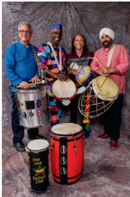
Funkadesi's Rhythm Ambassadors